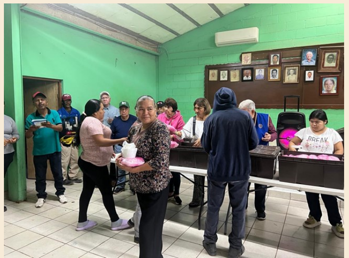
Los Mochis Rotarians served a New Year's chicken dinner to 110 families in the Village.