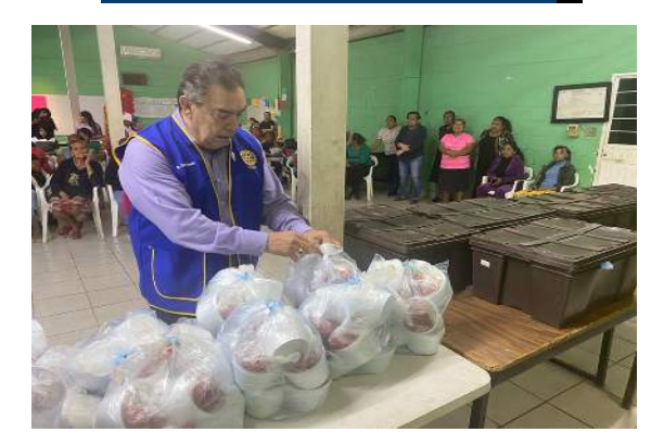
Members of Los Mochis Rotary recently delivered 100 meals to an impoverished area.