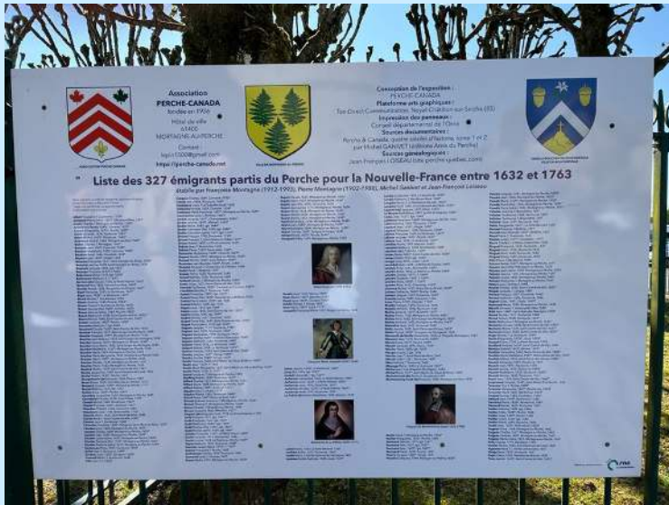
Signage in the garden adjacent to the Mortagne Au Perche City Hall celebrates the names of the families who emigrated to Boucherville in 1717. Descendants of many of these families including Boucher, Gagnon, Provost, Rivard, Ribault, and others later emigrated to Bourbonnais Grove.